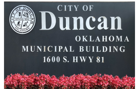
Mayor Robert Armstrong